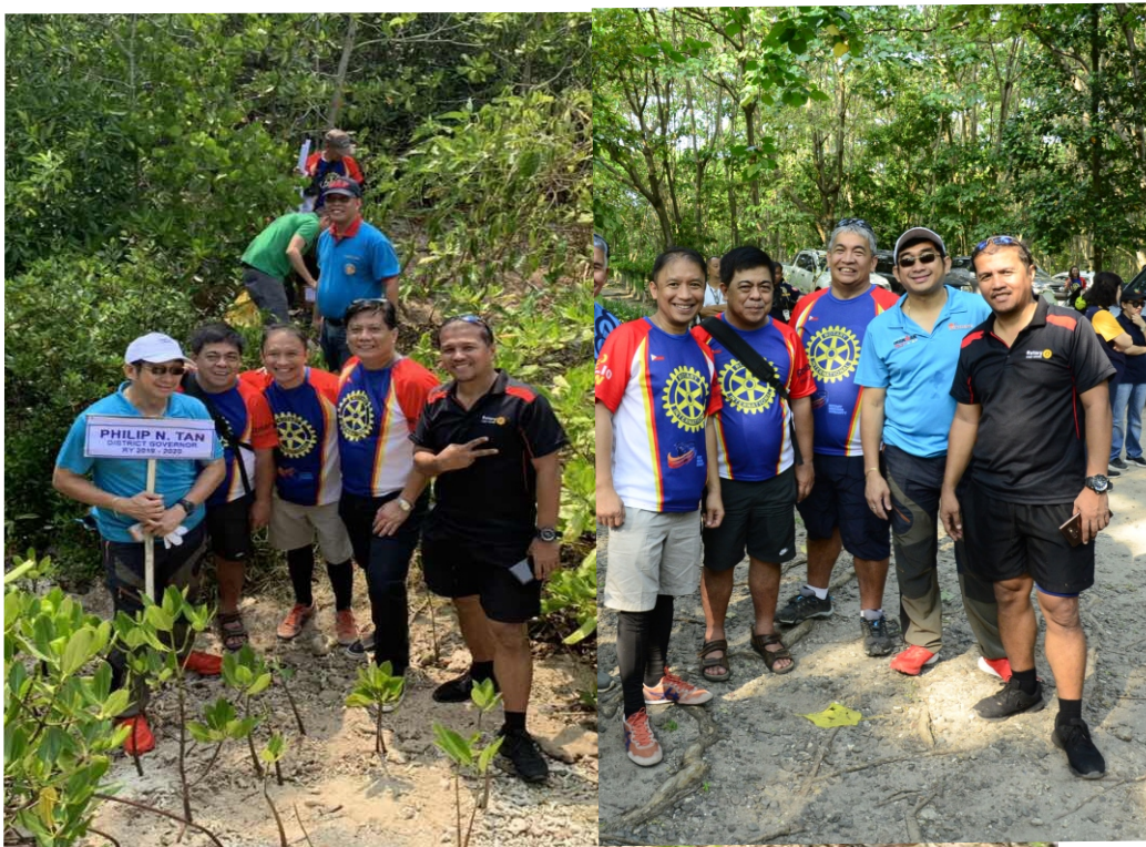
September 14, 2019 Participated in the Area 2 Mangrove Planting held at Aboitiz Cleanergy Park at Matina Pang...

Indeed another happy and fulfilling RCED Week!